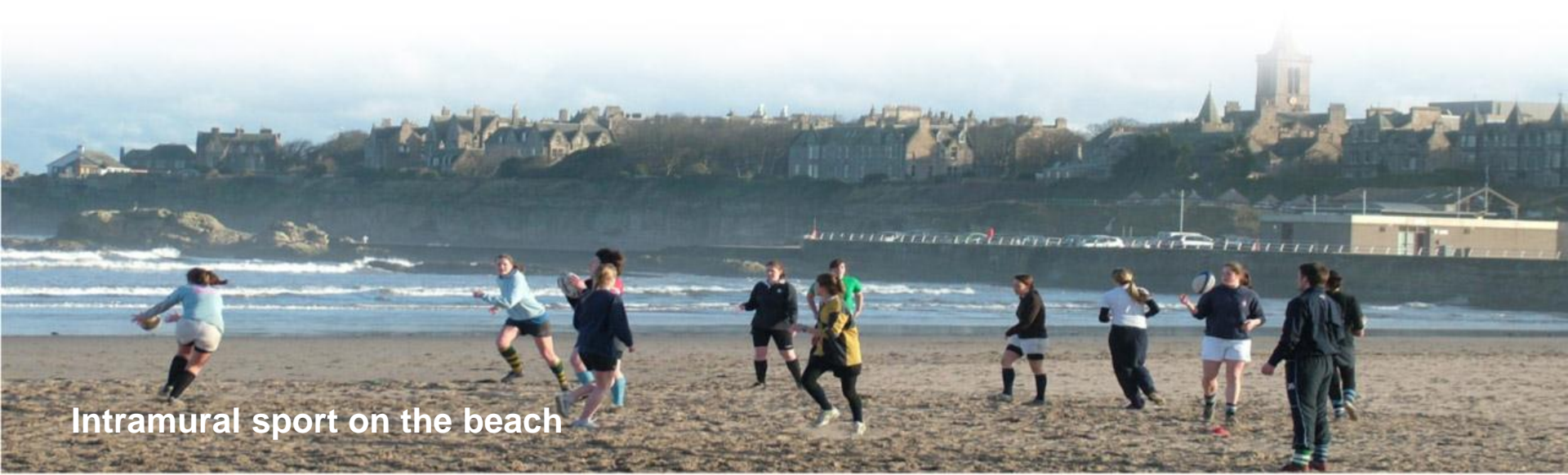
Intramural sport on the beach