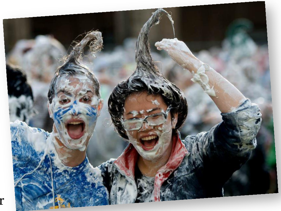
Raisin Weekend, October